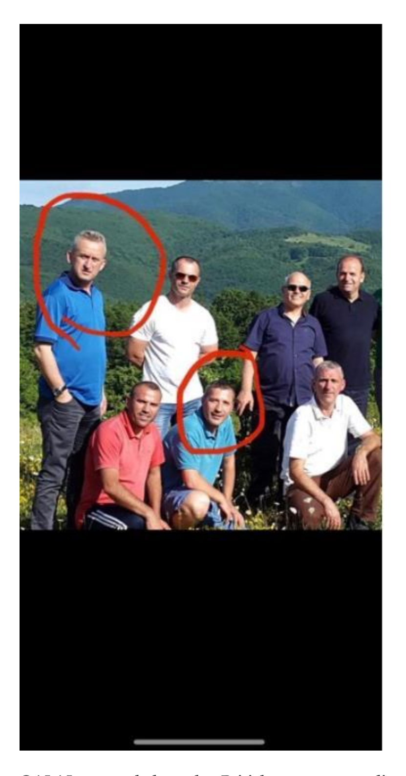
QALAJ responded to the British pressure to dismiss BEQIRI by giving him a promotion