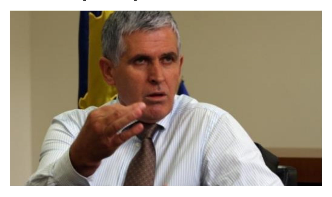
Azem SYLA's nephew is suspected to have been behind REXHEPI's '/stolen/ car' affair